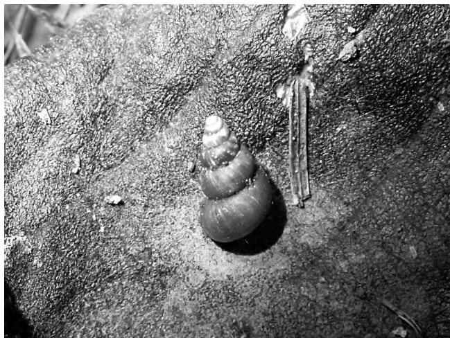
Fig. 3 Fukuia integra collected at Loc. 2.

the leaf litter layer. Empty N. micron shells were milky white in color due to weathering and more or less broken around the aperture.